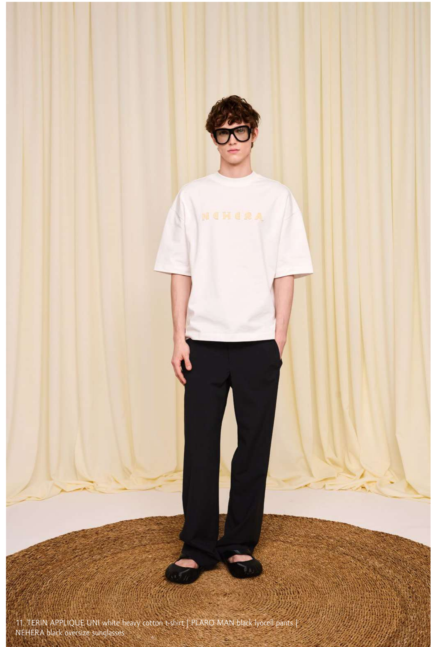
11. TERIN APPLIQUE UNI white heavy cotton t-shirt | PLARO MAN black lycell pants | NEHERA black oversize sunglasses