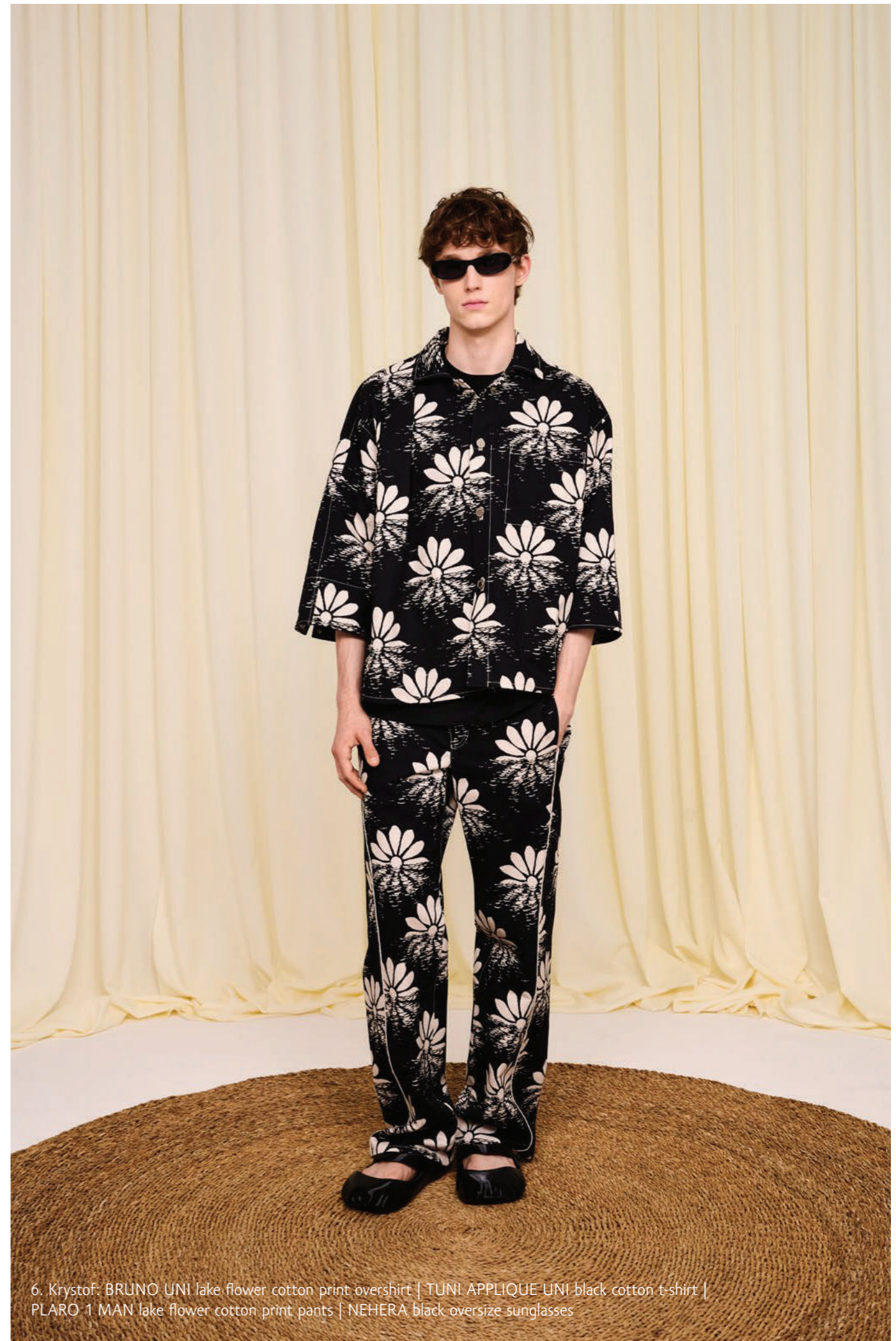
6. Krystof: BRUNO UNI lake flower cotton print overshirt | TUNI APPLIQUE UNI black cotton t-shirt | PLARO 1 MAN lake flower cotton print pants | NEHERA black oversized sunglasses