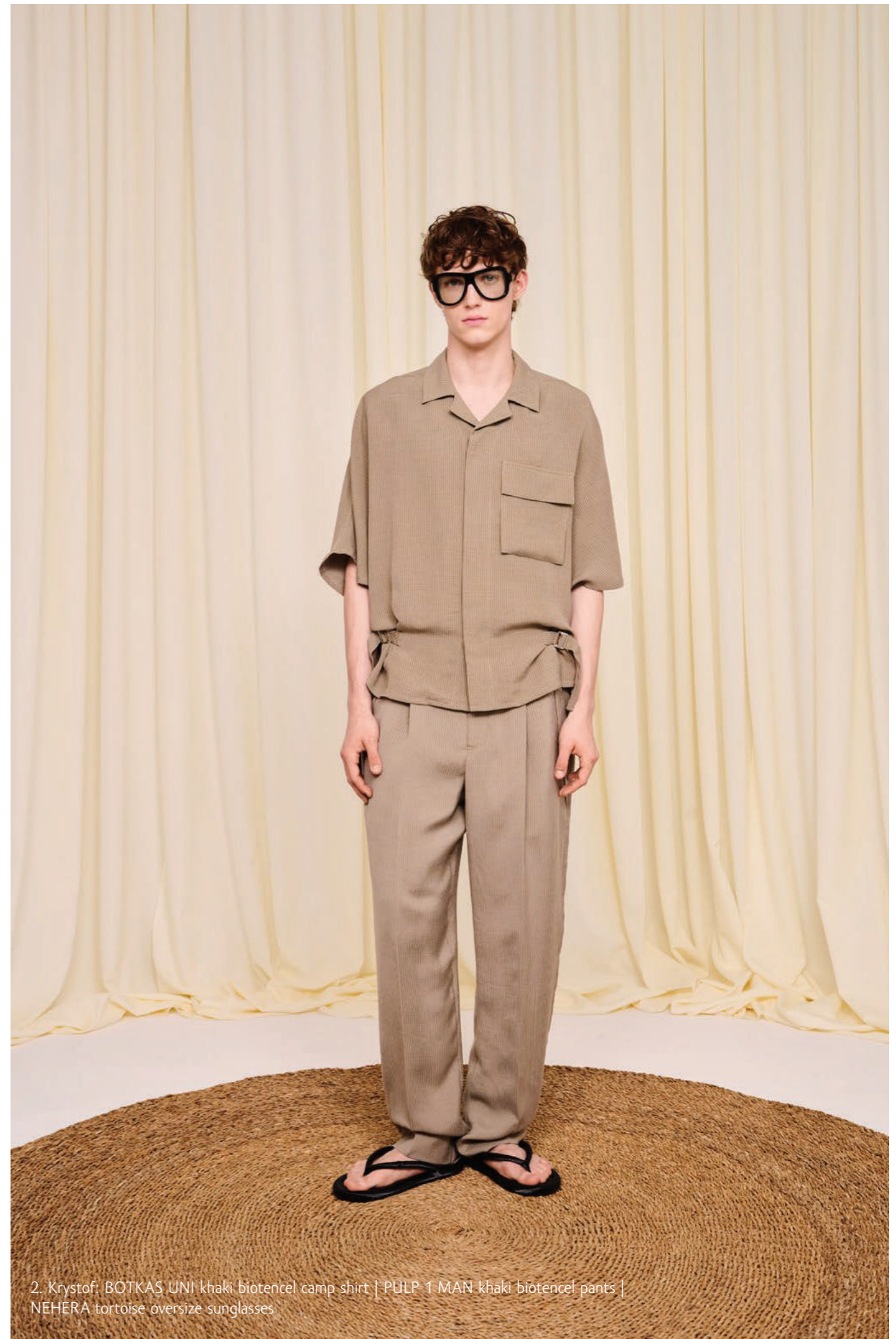
2. Krystof: BOTKAS UNI khaki biotencel camp shirt | PULP 1 MAN khaki biotencel pants | NEHERA tortoise oversize sunglasses