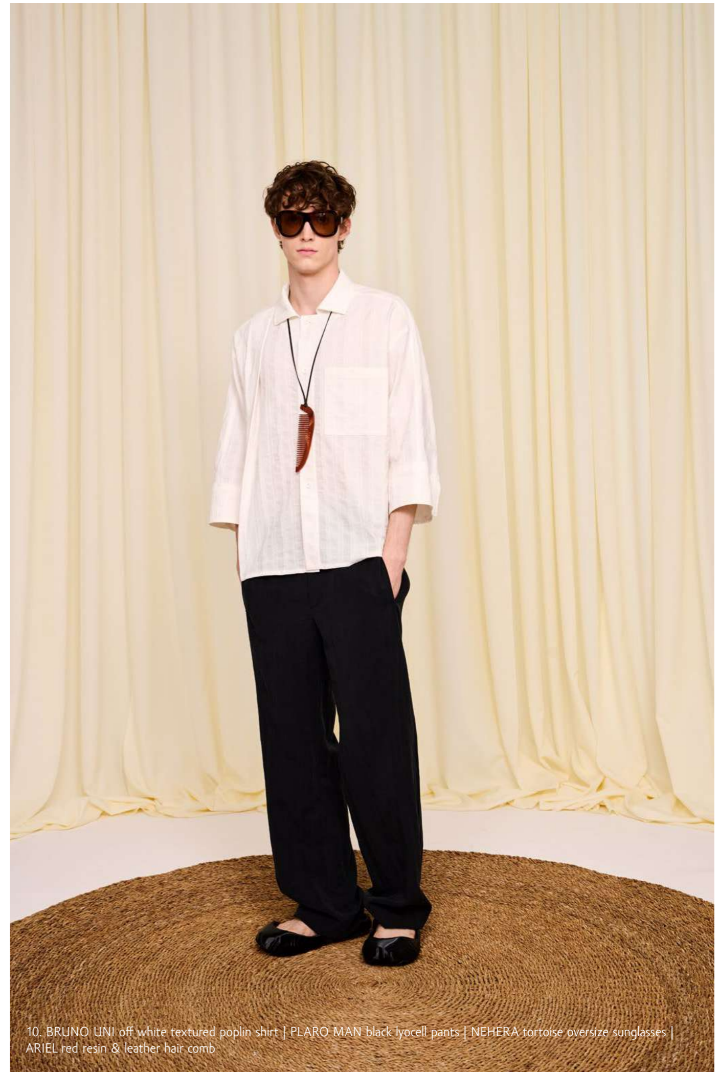
10. BRUNO UNI off white textured poplin shirt | PLARO MAN black lyocell pants | NEHERA tortoise oversize sunglasses | ARIEL red resin & leather hair comb