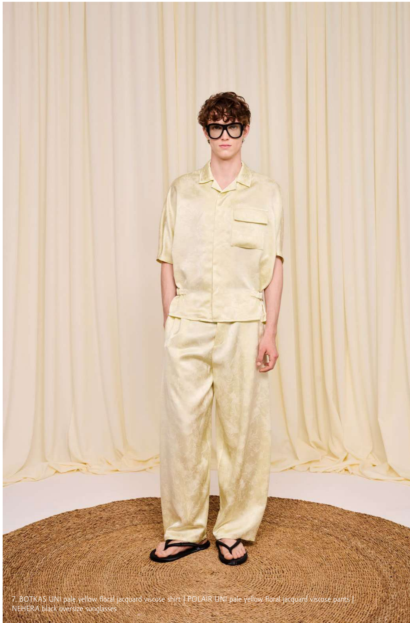
7. BOTKAS UNI pale yellow floral jacquard viscose shirt | POLAIR UNI pale yellow floral jacquard viscose pants | NEHERA black oversize sunglasses