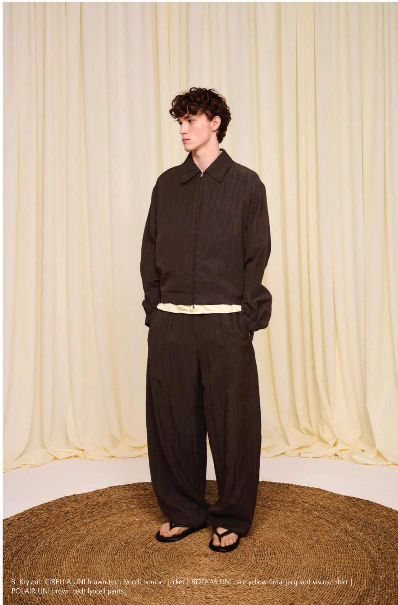
8. Krystof: CIRELLA UNI brown tech lyocell bomber jacket | BOTKAS UNI pale yellow floral jacquard viscose shirt | POLAIR UNI brown tech lyocell pants