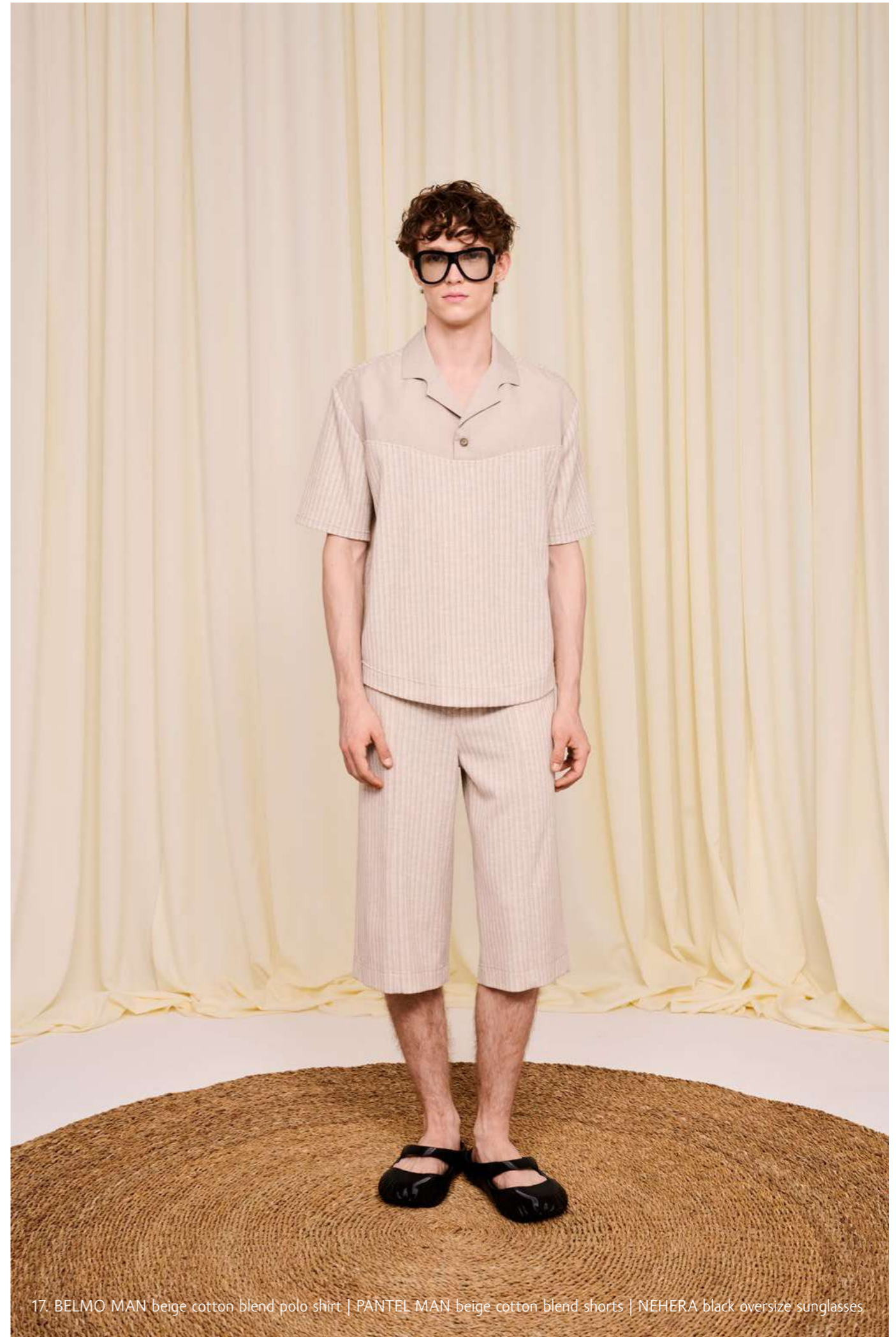
17. BELMO MAN beige cotton blend polo shirt | PANTEL MAN beige cotton blend shorts | NEHERA black oversize sunglasses