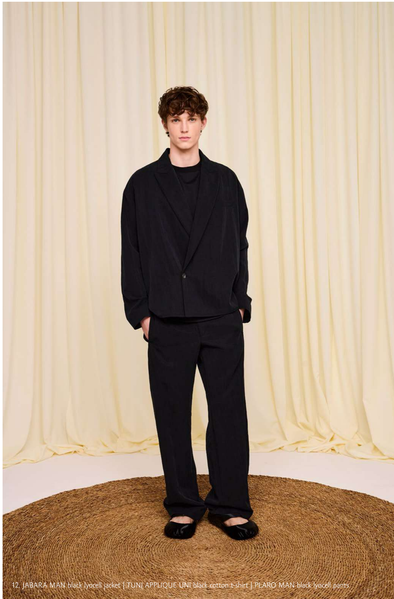
12. JABARA MAN black lyocell jacket | TUNI APPLIQUE UNI black cotton t-shirt | PLARO MAN black lyocell pants