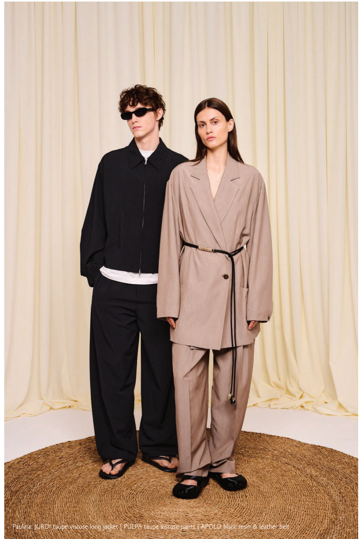
Paulina: JURDI taupe viscose long jacket | PULPA taupe viscose pants | APOLO black resin & leather belt