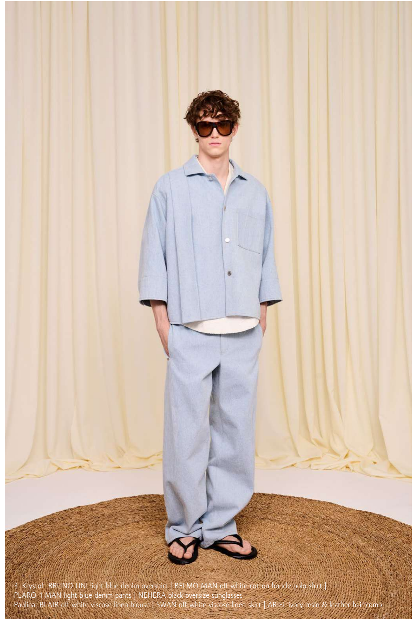
3. Krystof: BRUNO UNI light blue denim overshirt | BELMO MAN off white cotton boude polo shirt | PLARO 1 MAN light blue denim pants | NEHERA black oversize sunglasses Paulina: BLAIR off white viscose linen blouse | SWAN off white viscose linen skirt | ARIEL ivory resin & leather hair comb