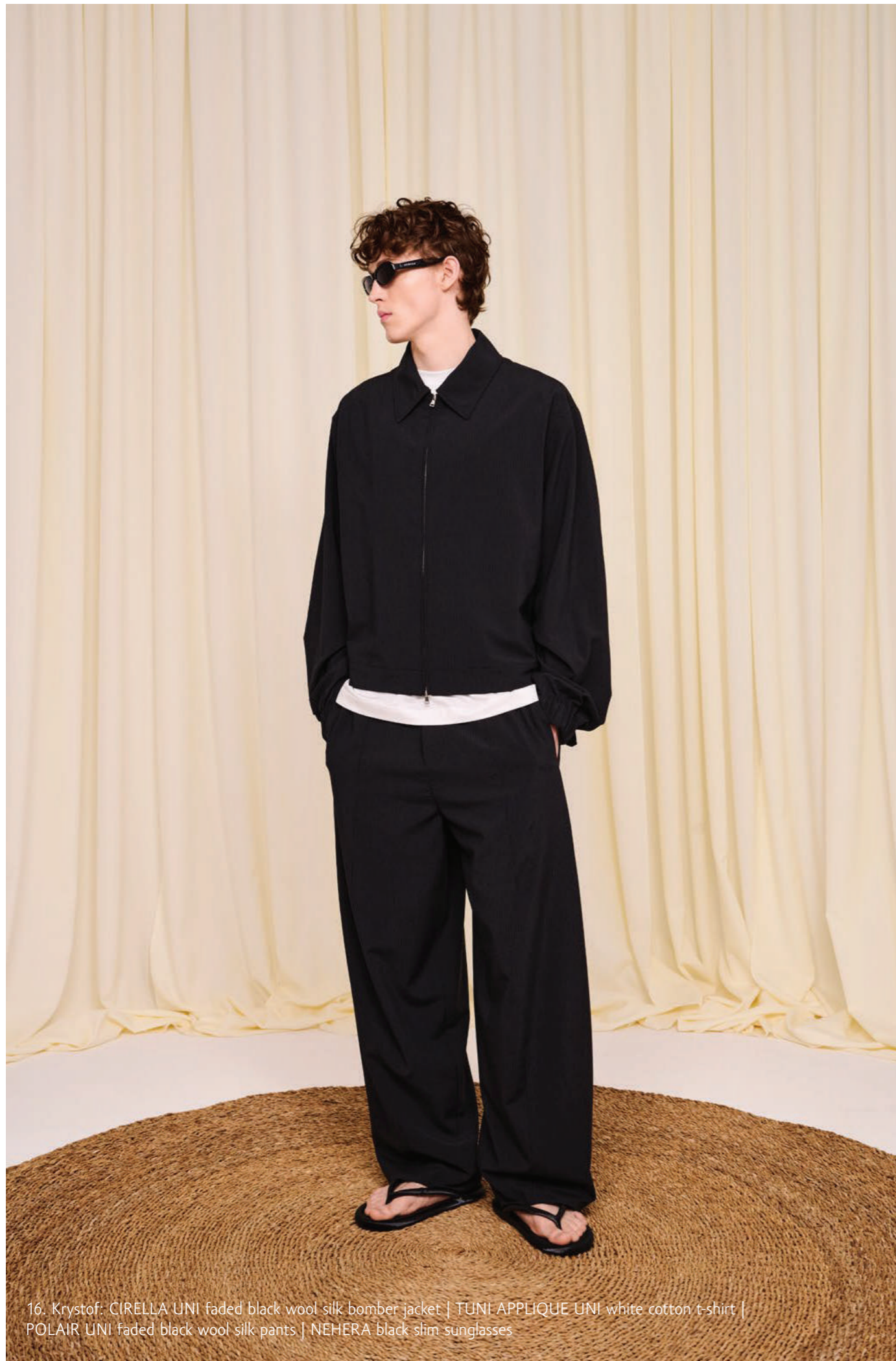
16. Krystof: CIRELLA UNI faded black wool silk bomber jacket | TUNI APPLIQUE UNI white cotton t-shirt | POLAIR UNI faded black wool silk pants | NEHERA black slim sunglasses