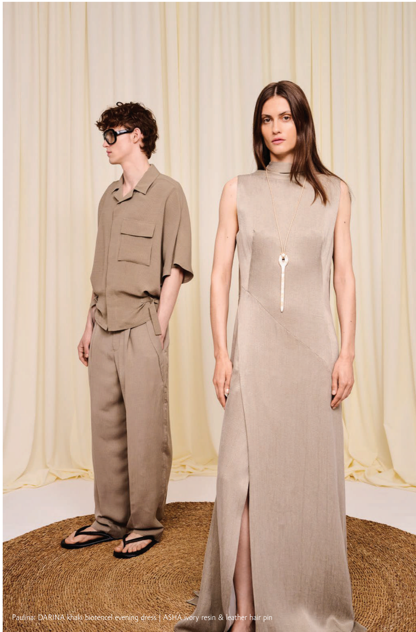
Paulina: DARINA khaki biotencel evening dress | ASHA ivory resin & leather hair pin