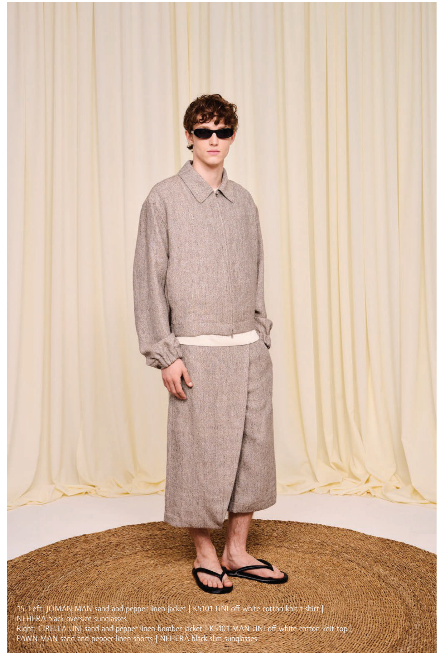
15. Left: JOMAN MAN sand and pepper linen jacket | K5101 UNI off white cotton knit t-shirt | NEHERA black oversize sunglasses Right: CIRELLA UNI sand and pepper linen bomber jacket | K5101 MAN UNI off white cotton knit top | PAWN MAN sand and pepper linen shorts | NEHERA black slim sunglasses