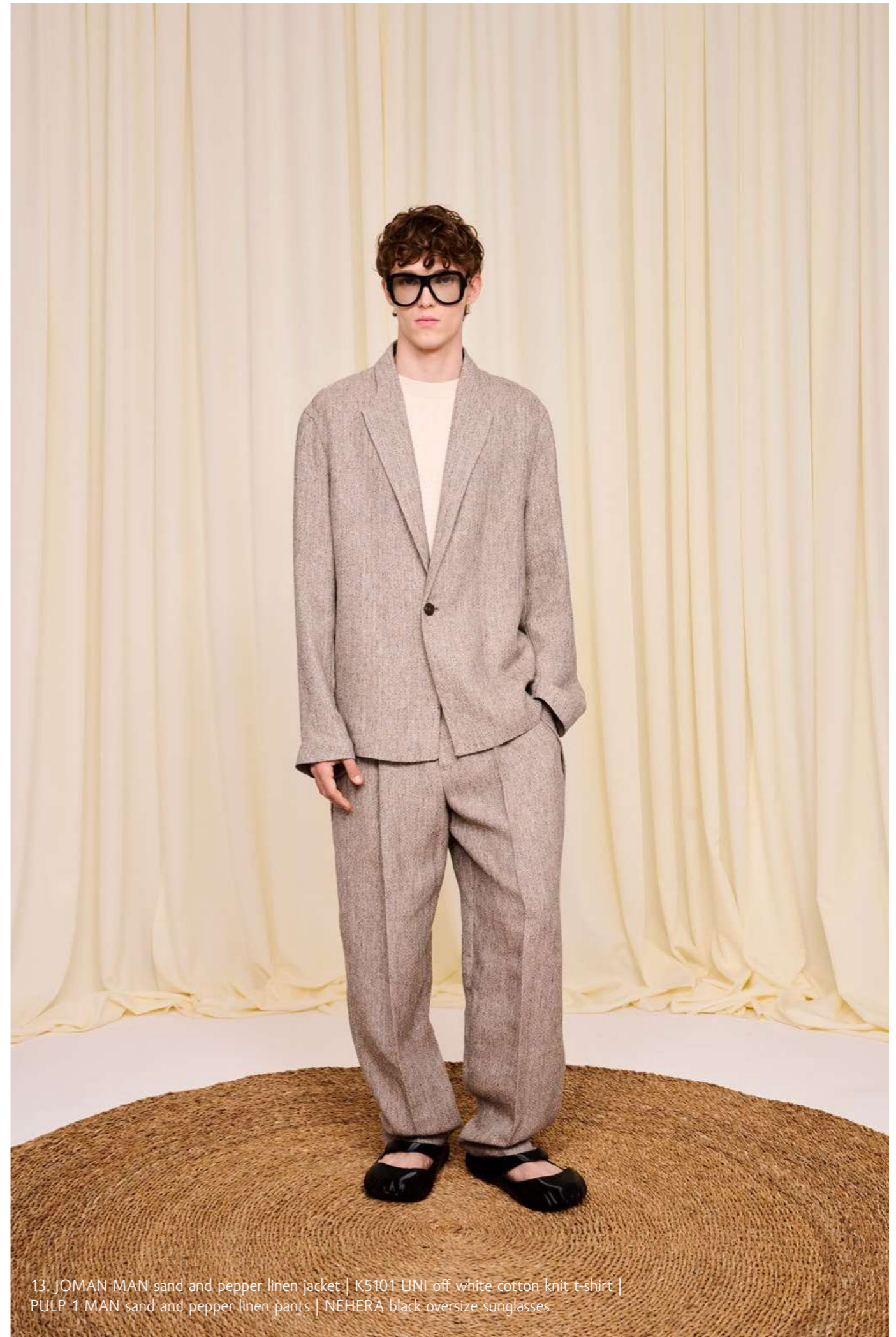
13. JOMAN MAN sand and pepper linen jacket | K5101 LUNI off white cotton knit t-shirt | PULP 1 MAN sand and pepper linen pants | NEHERA black oversize sunglasses