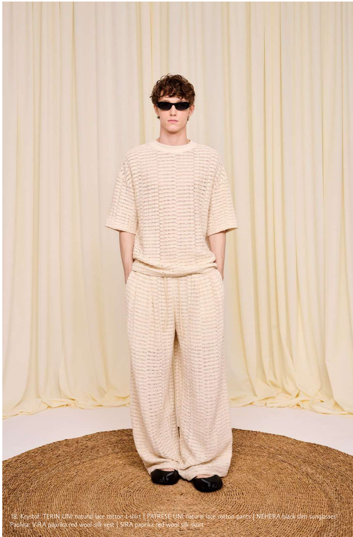
18. Krystof: TERIN UNI natural lace cotton t-shirt | PATRESE UNI natural lace cotton pants | NEHERA black slim sunglasses Paulina: VIRA paprika red wool silk vest | SIRA paprika red wool silk skort