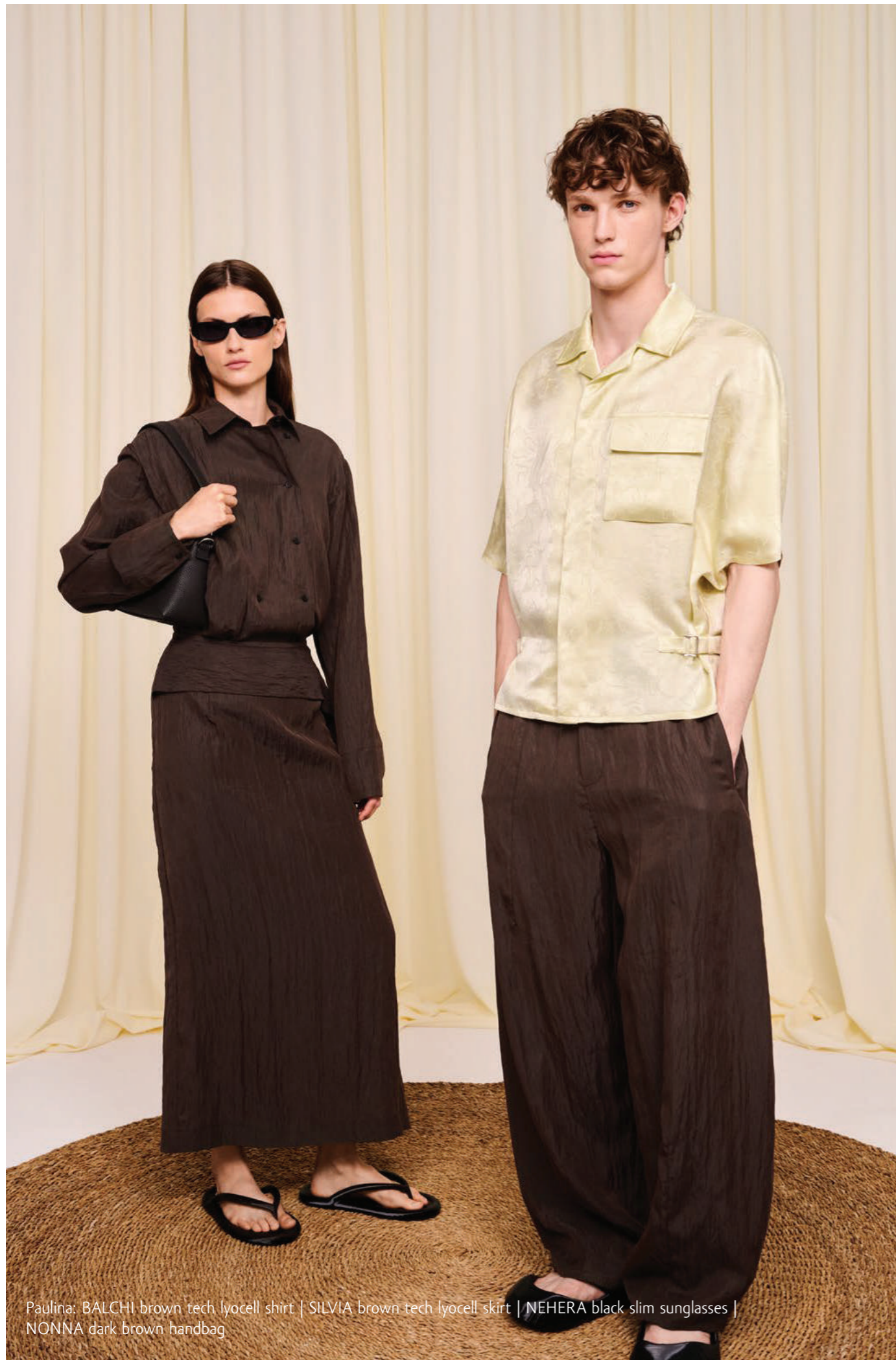
Paulina: BALCHI brown tech lyocell shirt | SILVIA brown tech lyocell skirt | NEHERA black slim sunglasses | NONNA dark brown handbag