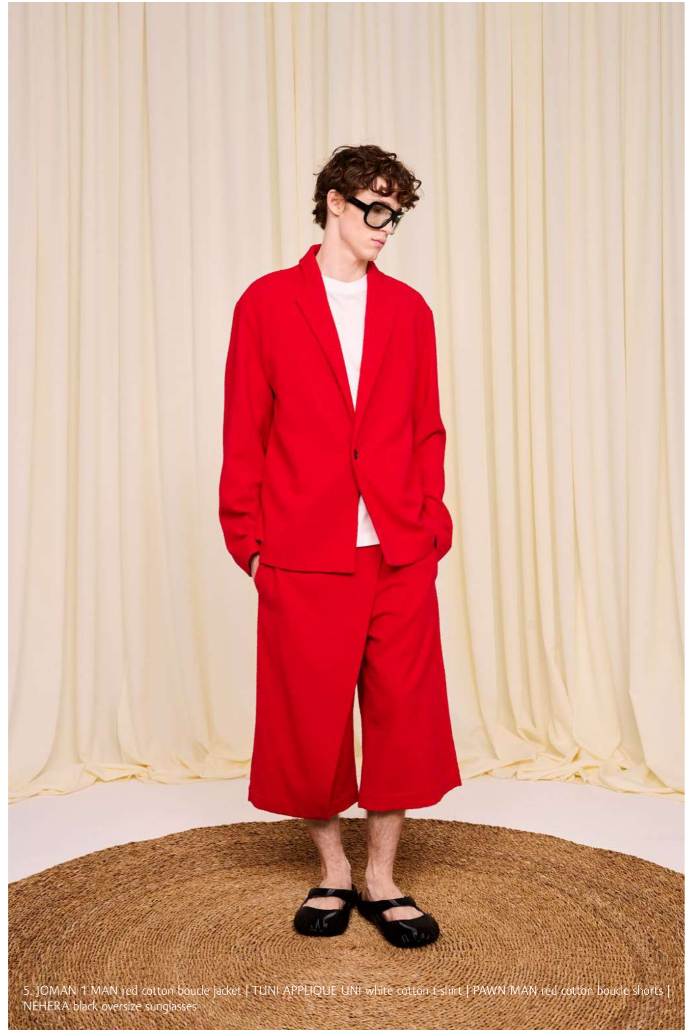
5. JOMAN 1 MAN red cotton boucle jacket | TUNI APPLIQUE UNI white cotton t-shirt | PAWN MAN red cotton boucle shorts | NEHERA black oversize sunglasses