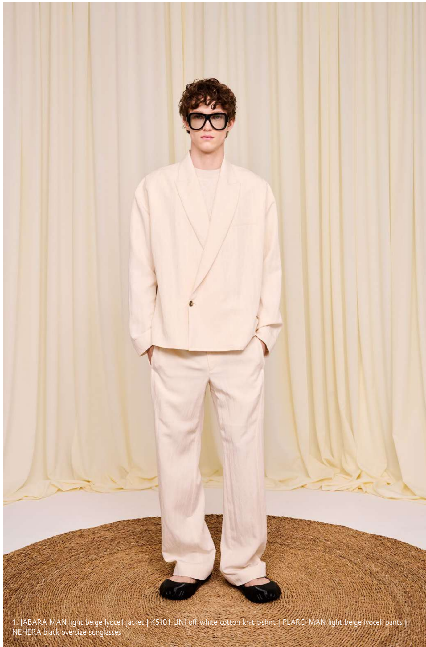
1. JABARA MAN light beige lyocell jacket | K5101 LINI off white cotton knit t-shirt | PLARO MAN light beige lyocell pants | NEHERA black oversize sunglasses