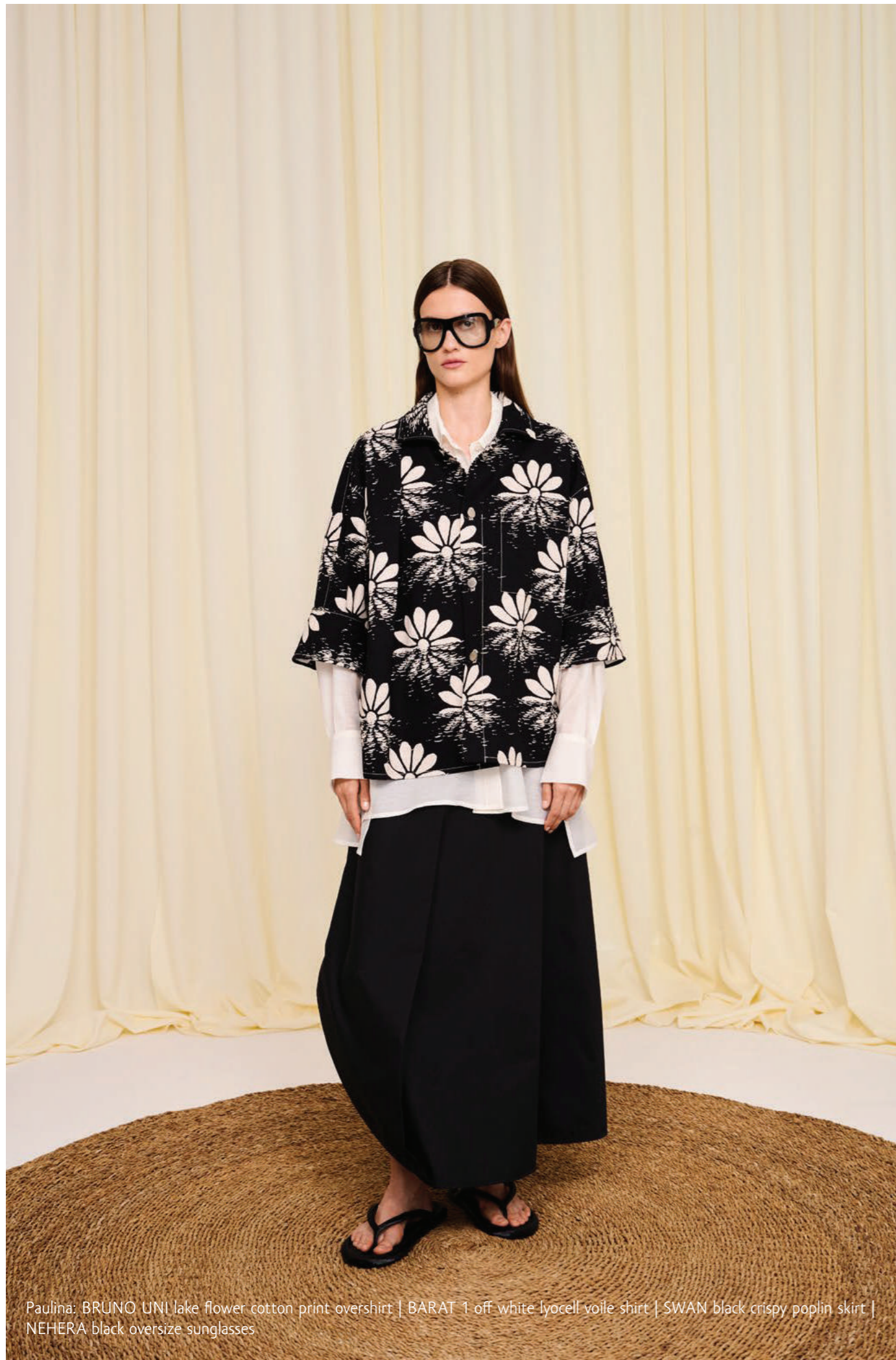
Paulina: BRUNO UNI lake flower cotton print overshirt | BARAT 1 off white lyocell voile shirt | SWAN black crispy poplin skirt | NEHERA black oversized sunglasses