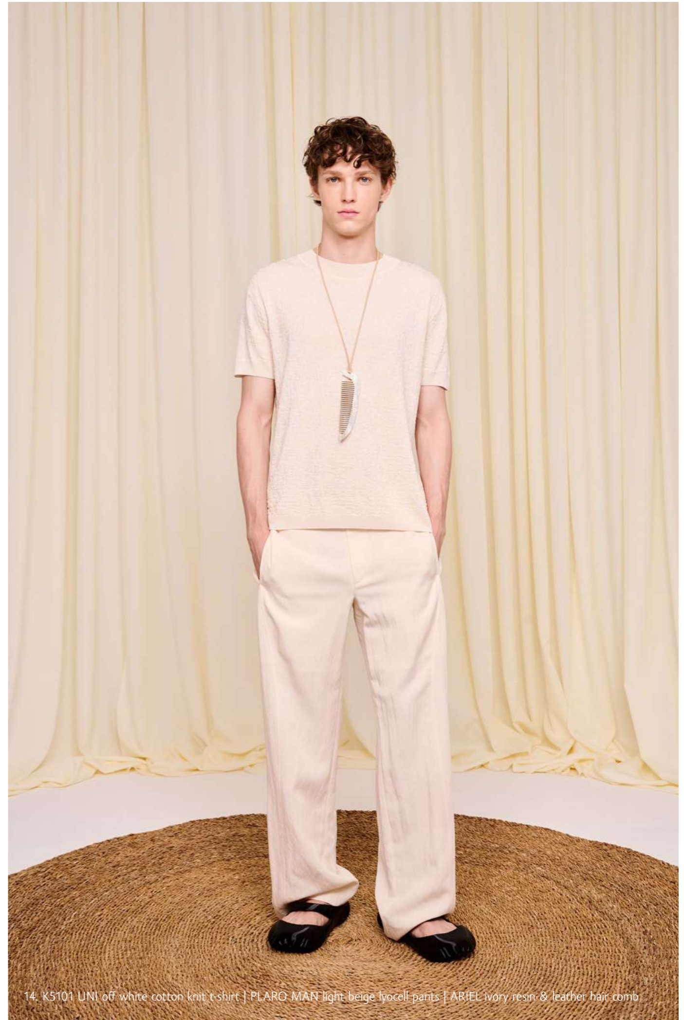
14. K5101 UNI off white cotton knit t-shirt | PLARO MAN light beige lyocell pants | ARIEL ivory resin & leather hair comb