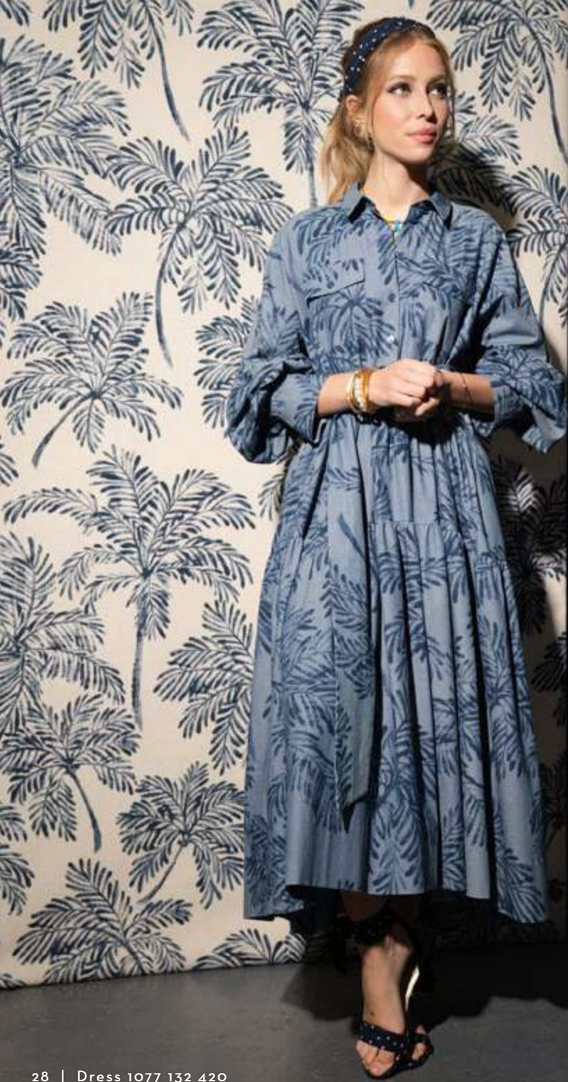
28 | Dress 1077 132 420