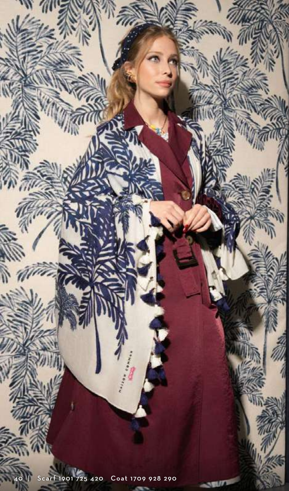
40 | Scarf 1901 725 420 Coat 1709 928 290