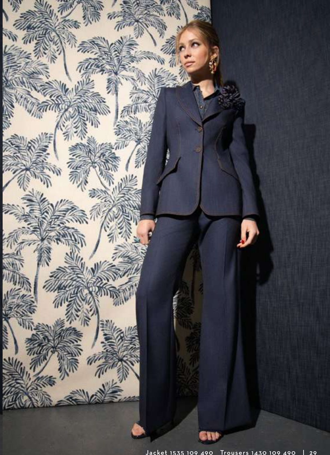
Jacket 1535 109 490 Trousers 1430 109 490 | 29