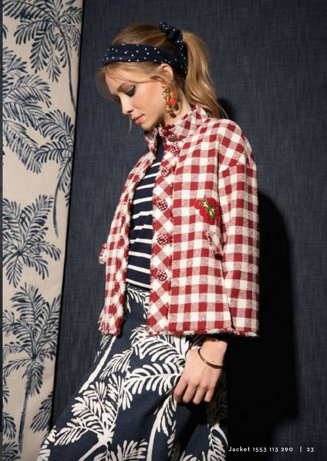
Jacket 1553 113 290 | 23