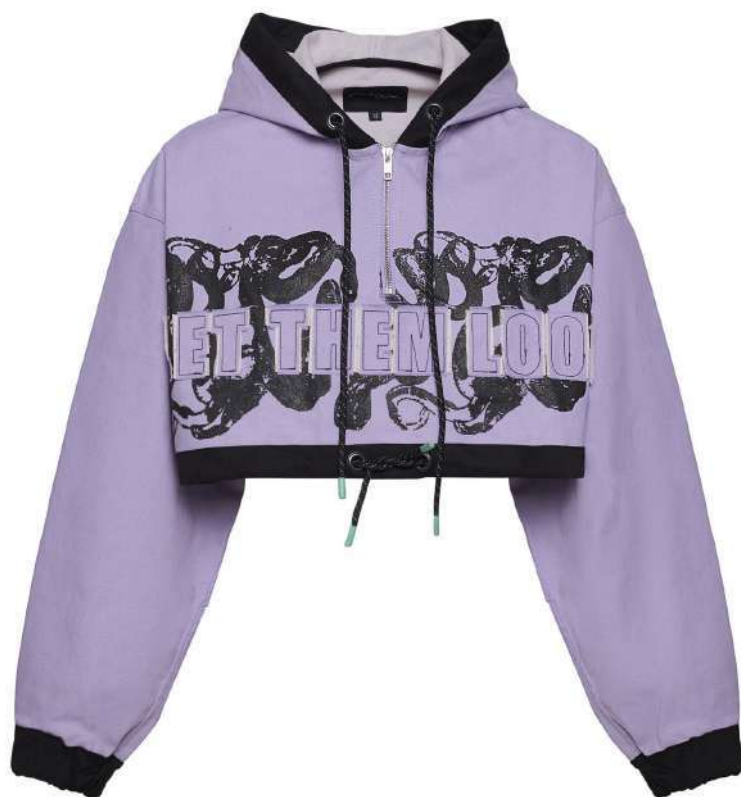
Ref. SS26.DRSS01b : Mesh Dress (XS) Ref. SS26.SWT03a : Lilac Gaze Crop Sweater (M)