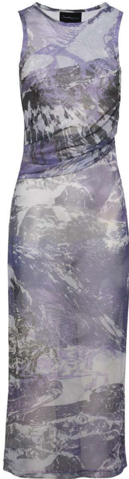
Ref. SS26.DRSS01b : Mesh Dress (XS)