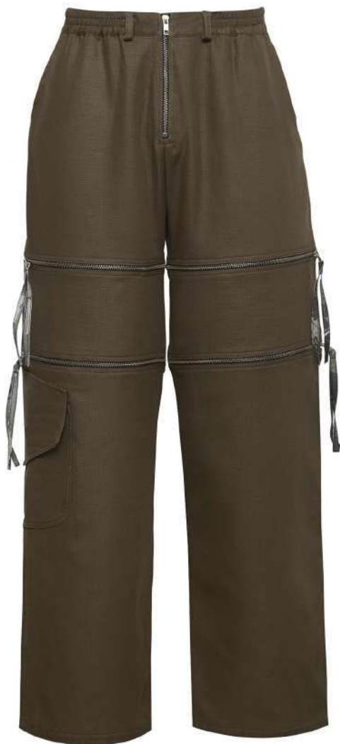
Ref. SS26.SWT02a : Off-White Gaze Sweater (M) Ref. SS26.TRS02a : Green Gorgon Trousers (M)