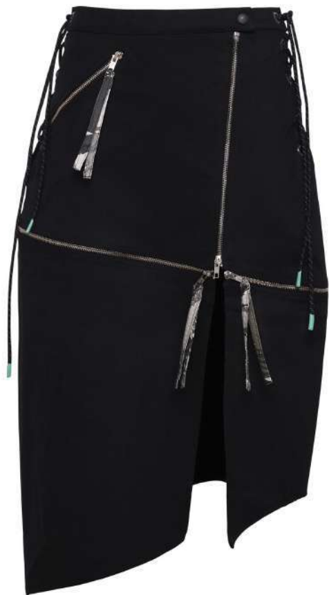
Ref. SS26.JKT02a : Petra Biker Jacket (M) Ref. SS26.SKRT02a : Black Pegasus Skirt (S) Ref. SS26.TRS03a : Satin Slither Trousers (M)