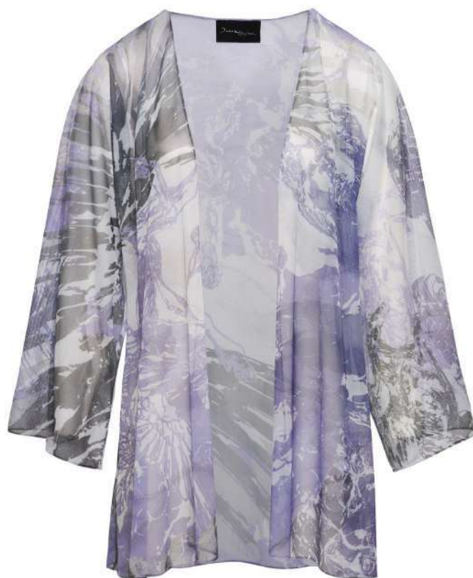
Ref. SS26.WKMN01 : Mesh Kimono (S/M) Ref. SS26.WTP01c : Mesh Medusa Top (XS) Ref. SS26.SKRT02b : Denim Pegasus Skirt (S)