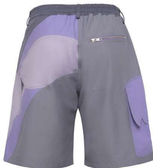
Ref. SS26.SHRT01c : Green Shirt (M) Ref. SS26.SHRT03b : Satin Long Shirt (S) Ref. SS26.SHRTS01b : Gorgon Shorts (M)