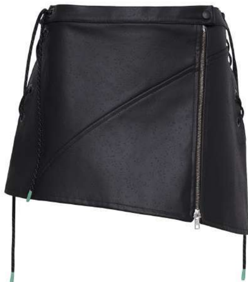
Ref. SS26.JKT02a : Petra Biker Jacket (XS) Ref. SS26RT.SK02d : Petra Pegasus Skirt (S) Ref. SS26TSHRT00a : Pegasus T-Shirt (S)