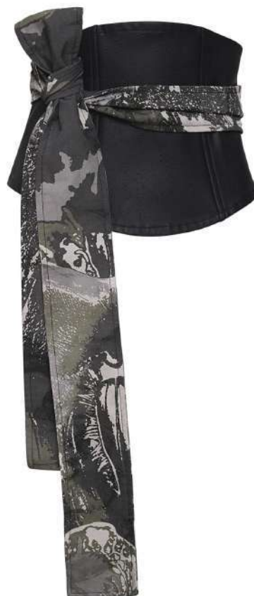
Ref. SS26.SHRT04a : Lilac Snake Shirt (XS) Ref. SS26.CRST01 : Petra Corset (US) Ref. SS26.LSLV01 : Mesh Longsleeve (XS) Ref. SS26.WSKRT01 : Mesh Skirt (XS)