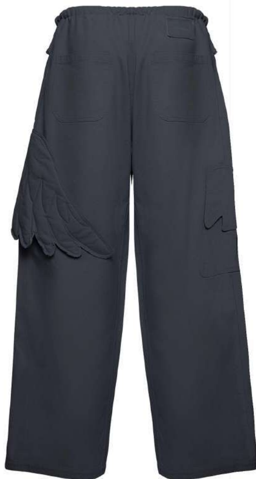
Ref. SS26.SHRT02b: Satin Gorgon Shirt (M) Ref. SS26.TRS00d: Pegasus Trousers (M)