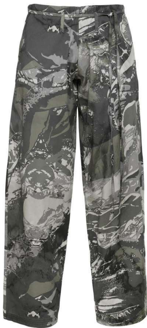
Ref. SS26.TRS00b : Printed Hajime Trousers (XS)