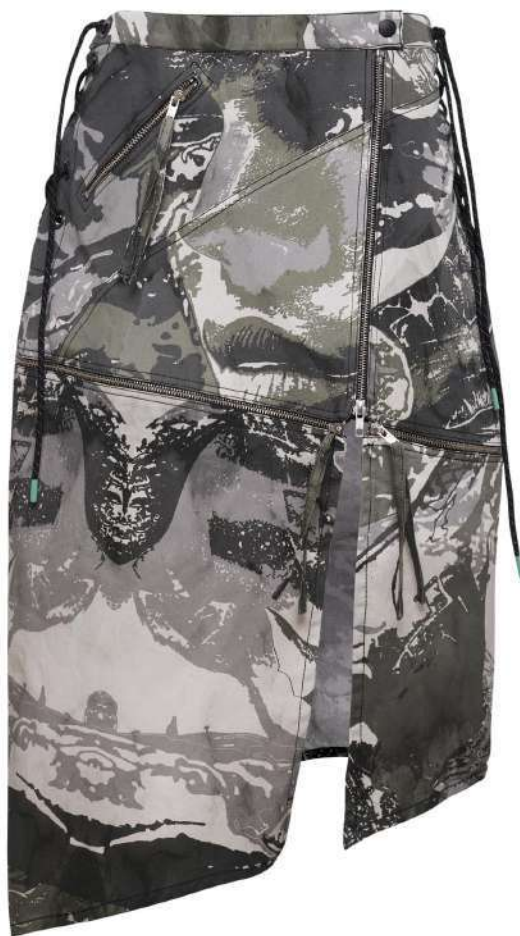
Ref. SS26.SWT00 : Medusa Sweater (XL) Ref. SS26.SKRT02c : Printed Pegasus Skirt (S)