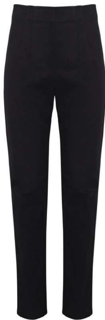
Ref. SS26.WTP03a : Off-White Slither Top (XS) Ref. SS26.WTRS01 : Fitted Black Trousers (XS)