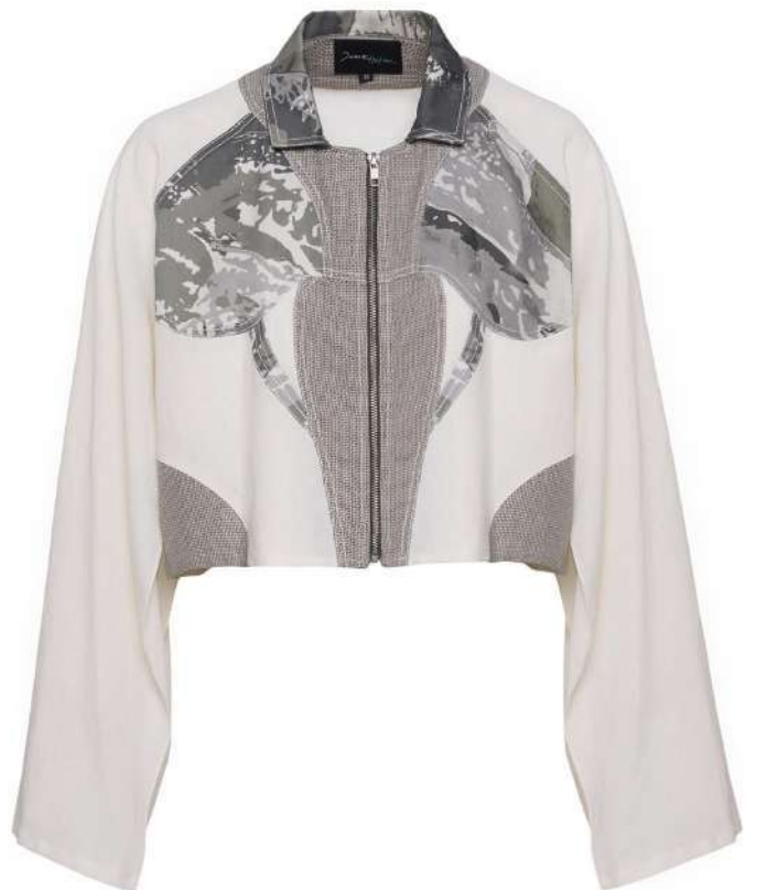
Ref. SS26.WTP01b : Scales Medusa Top (XS) Ref. SS26.SHRT04b : Off-White Snake Shirt (M) Ref. SS26.SHRTS02b : Waterproof Pegasus Shorts (XS)