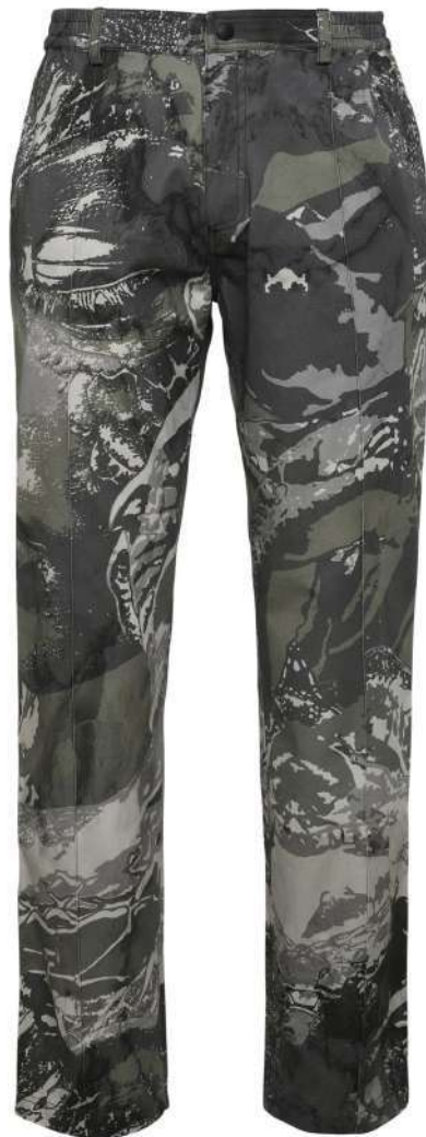
Ref. SS26.JKT01bb : Printed Pegasus Trucker w/ Wings (M) Ref. SS26.TRS01a : Printed Trousers (M)