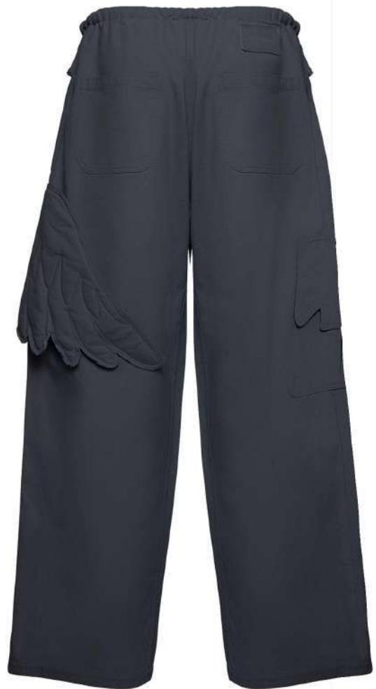
Ref. SS26.KMN01a : Cotton Kimono (S/M) Ref. SS26.TRS00c : Pegasus Trousers (M)