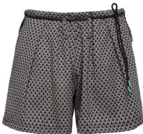
Ref. SS26.SWT02c : Waterproof Gaze Sweater (M) Ref. SS26.SS26.SHRTS02a : Scales Pegasus Shorts (M)