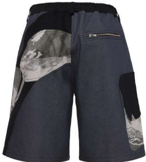
Ref. SS26.JKT02a : Petra Biker Jacket (M) Ref. SS26.SHRTS01a : Denim Gorgon Shorts (M)