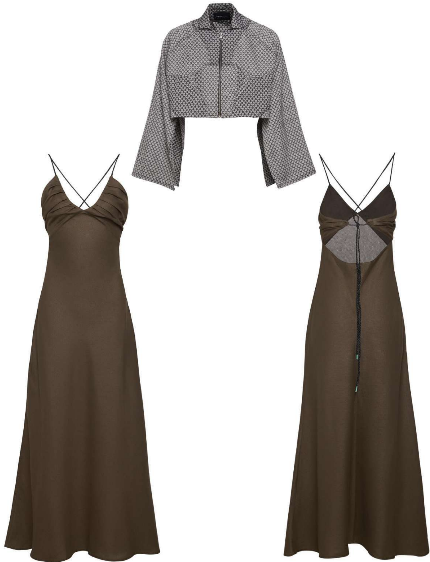
Ref. SS26.SHRT04c: Scales Snake Shirt (XS)