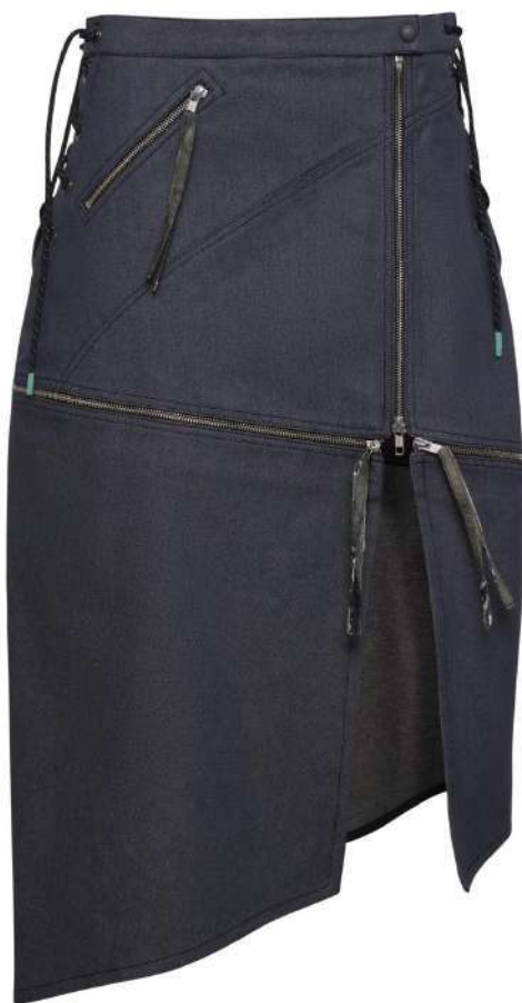
Ref. SS26.JKT01aa : Pegasus Trucker w/ Wings (XS) Ref. SS26.SKRT02b : Denim Pegasus Skirt (S)