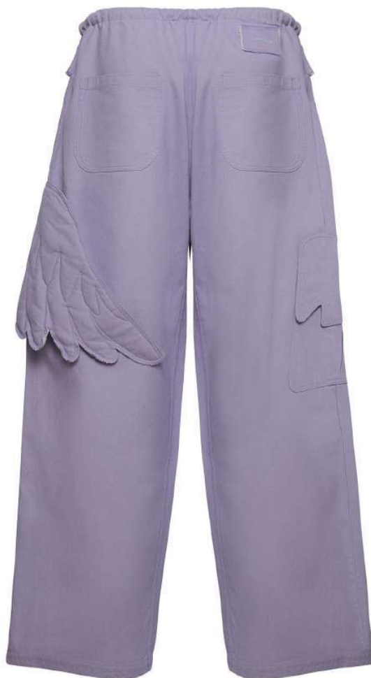
Ref. SS26.JKT02b : Denim Biker Jacket (M) Ref. SS26.TRS00c : Lilac Pegasus Trousers (M)