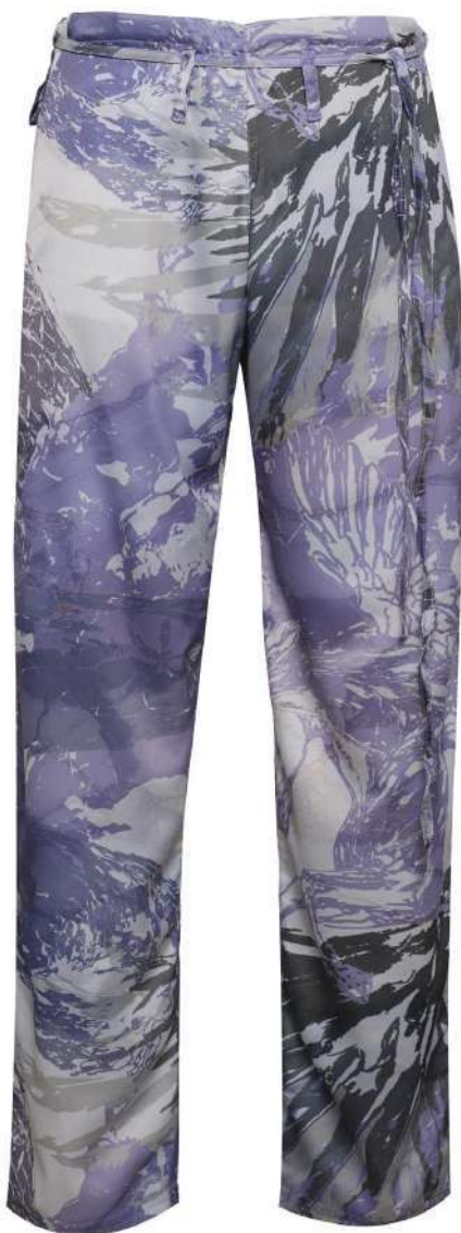
Ref. SS26.SHRT02c : Textured Gorgon Shirt (M) Ref. SS26.TRS00a : Satin Hajime Trousers (M)