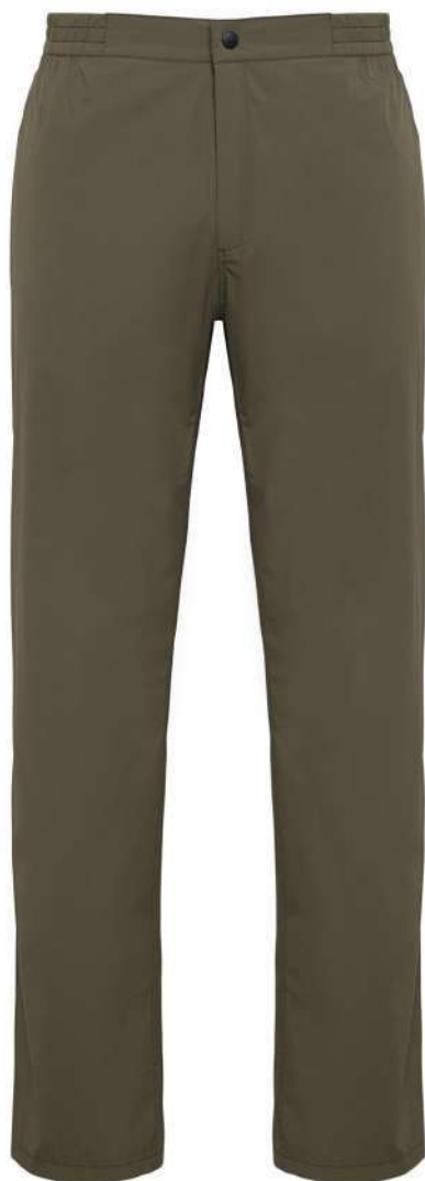
Ref. SS26.BBR01c : Waterproof Snake Bomber (M) Ref. SS26.TRS01b : Waterproof Trousers (M)