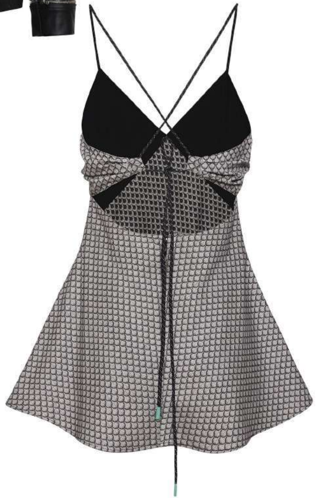
Ref. SS26.JKT02a : Petra Biker Jacket (XS) Ref. SS26.DRSS02c : Scales Slither Short Dress (XS)