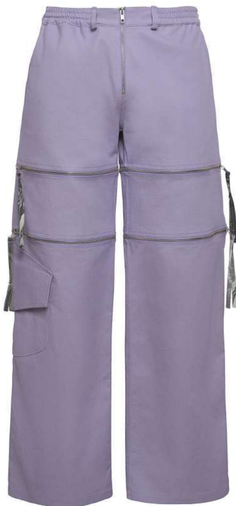
Ref. SS26.KMN01b : Satin Kimono (US) Ref. SS26.TRS02b : Lilac Gorgon Trousers (M)